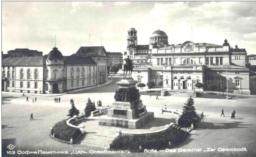
Image 2: The Complex with the Memorial, the National Assembly, Alexander Nevsky Cathedral, and the Academy of Sciences

many high-ranking guests of honor, including Prince Ferdinand I, the “Chosen Prince” (and tsar from 1908 onward); 4 other guests included the son of the tsar depicted in the monument, Grand Duke Vladimir Alexandrovič 5 ; military officers, such as General Stoletov, who had won the battle at Shipka; the son of General Gurko; veterans, etc.; the artist himself was also present.