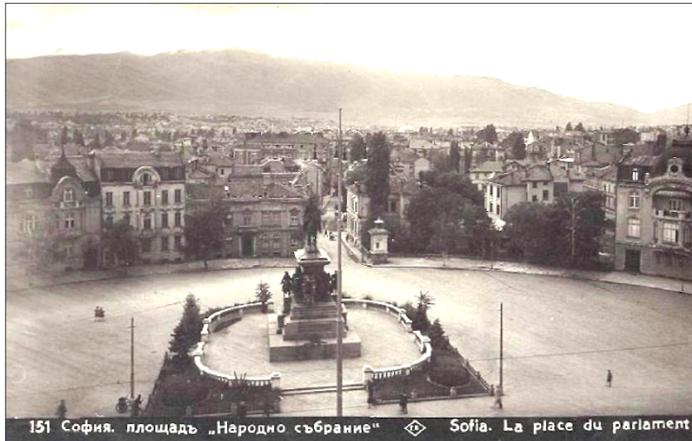
Image 3: The square in front of the parliament building, with the monument in the foreground and city and Vitoshka mountains in the background.

One might like to add to this that the development of the city brought with it certain changes in perspectives. At the time of its construction, one could easily look past the memorial and see the city and Vitoshka mountains in the background (see Image 3). Today, the view is restricted due to the presence of tall new buildings (including an expensive hotel) which seem to form the background behind the monument. The view however, which the tsar himself has from his horse has remained unchanged, because the ensemble consisting of the National Assembly, the Academy of Sciences, and Nevsky Cathedral is same today as it has been at the beginning of the 20 th century. Only the view to the right area where the university is located, which was an open space at the time the monument was constructed, is now blocked by trees that have grown in the meantime. The part of the Sofia that is shown in Image 3, by the way, was built not long before the construction of the memorial, during a time when the new capital rapidly grew. These districts stem from the 1880s and, most importantly, offered to the nobility the possibility of settling near the government district.