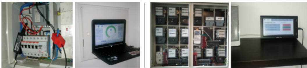
Figure 1. Low-cost NILM sensing system: single-house (left), multi-house (right)

Our hardware/software platform evolved according to the requirements of the different deployments. From our initial setup was located in the mains and the ecofeedback was provided on-site (Figure 1 – left), it was later expanded into a full-fledge sensing platform with a dedicated multi-channel DAQ for multiple household studies of the long-term effects of ecofeedback (Figure 1 – right).