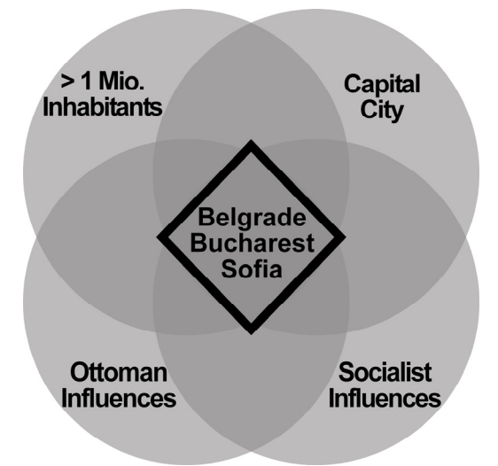
Figure 1 - The Balkan "metropolitan diamond"

tory. In large parts, this still is the case even today. The analysis of Balkan Metropolises deals with impacts of urban history, post-socialist transition and Europeanization. At first, we look at the consequences of these challenges on urban geographies and underline our findings with some examples, each of them taken from one of the three metropolises. Secondly, we highlight the role of large centers for structural changes and spatial development in their national context by asking how far they act as key agents of transition. Third, we discuss the cities' position within the European metropolitan landscape. As it will be showed, the three major metropolises in the Balkans have certain things in common which separate them from many other post-socialist cities.