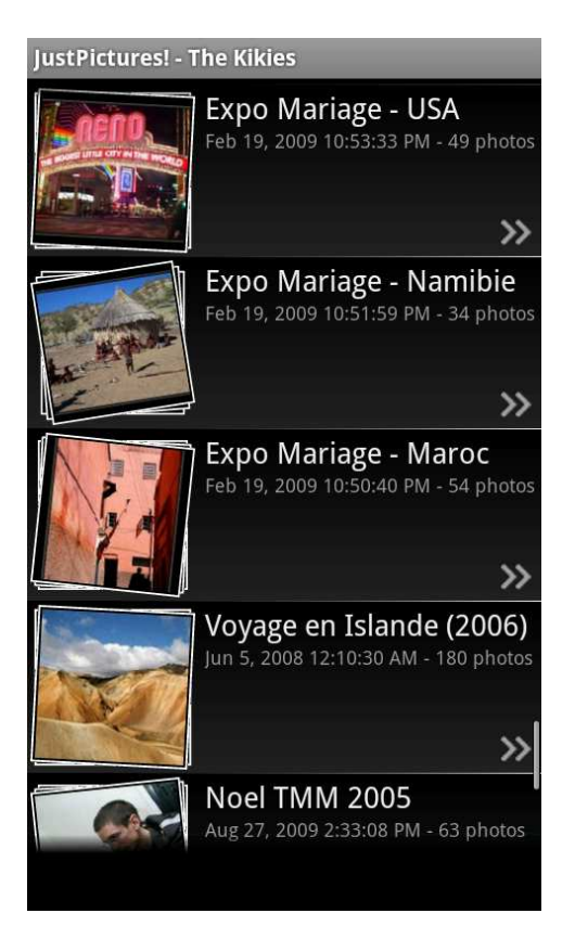
Figure 2: JustPictures in album view

Within this section, we only describe some of the existing applications that deal with the administration of image collections on mobile devices. Mor Naaman et al. give a more detailed overview in [Naaman et al. , 2008].