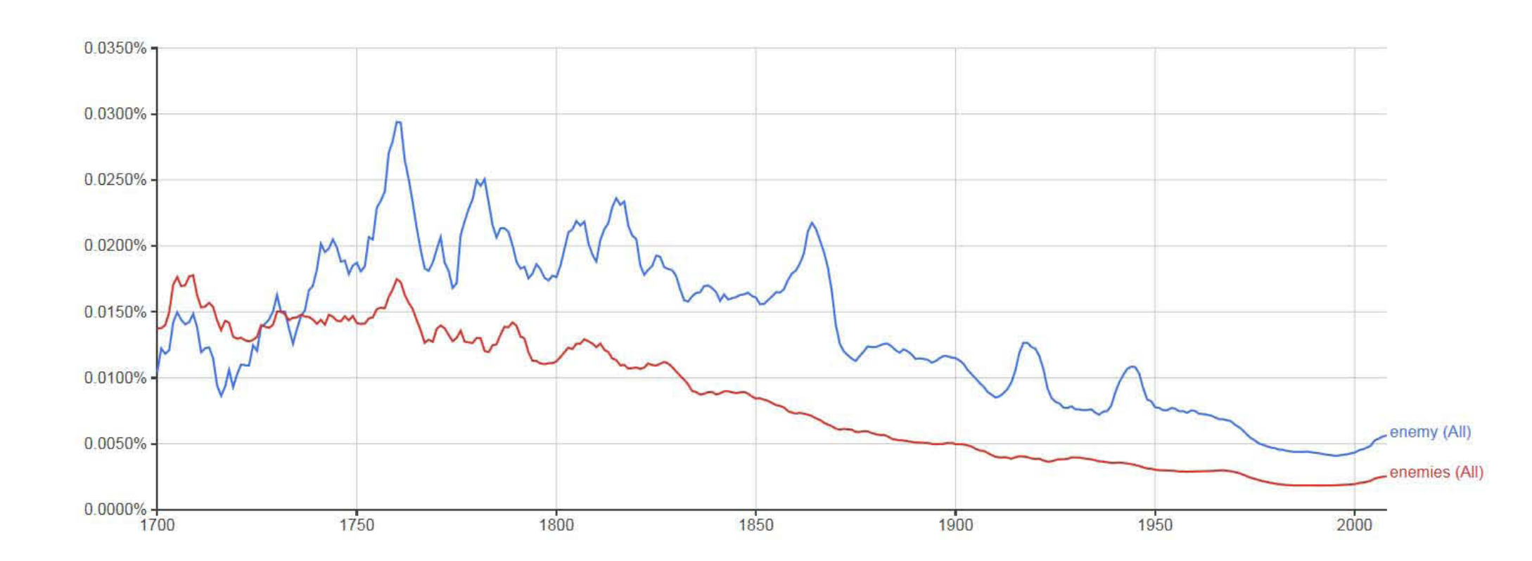
Figure 1. Google nGram for enemy and enemies.