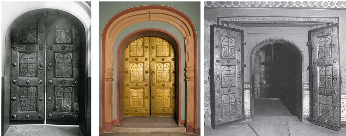
Figure 1: The Byzantine doors in the St Sophia cathedral in Novgorod, Russia (left: 19 th century photography; centre: TRIFONOVA 2015, p. 8; right: Velikij Novgorod. Istorija i kultura IX–XVII vekov, in: Entsiklopedičeskij slovar. SPb.: Nestor Istorija, 2007, p. 251).

The doors are located at the entrance to the side chapel of the Nativity of the Virgin (Fig. 1). The size of the doors does not match the dimensions of the doorway to the chapel, which was built only in the last quarter of the 17 th century during the construction activities of metropolitan Cornelius (1674–1695), 1 which implies that they were probably made for an as yet unknown original location inside the cathedral. However, we cannot exclude a mistake in measurements, as also happened in Monreale, Italy, with the bronze door of Bonanus of Pisa. There, a door with a straight top was placed behind a pointed-arched portal, which suggests either changes in planning during the construction of the portal or communication problems with or within the workshop.