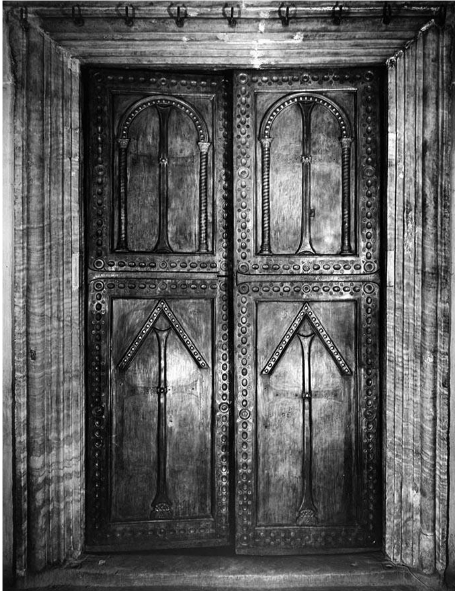
Figure 4: Bronze door, 6 th century, Constantinople, central door of the exonartex of the Hagia Sophia, Istanbul