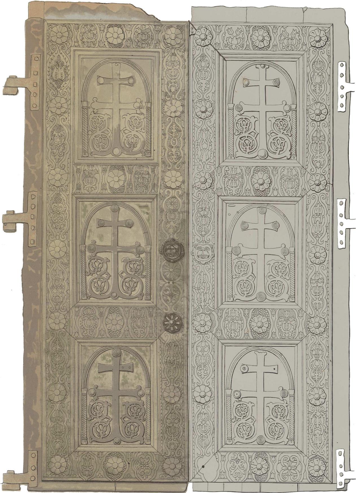
Figure 3: The Byzantine doors after SOLNTSEV 1853, pl. 20.