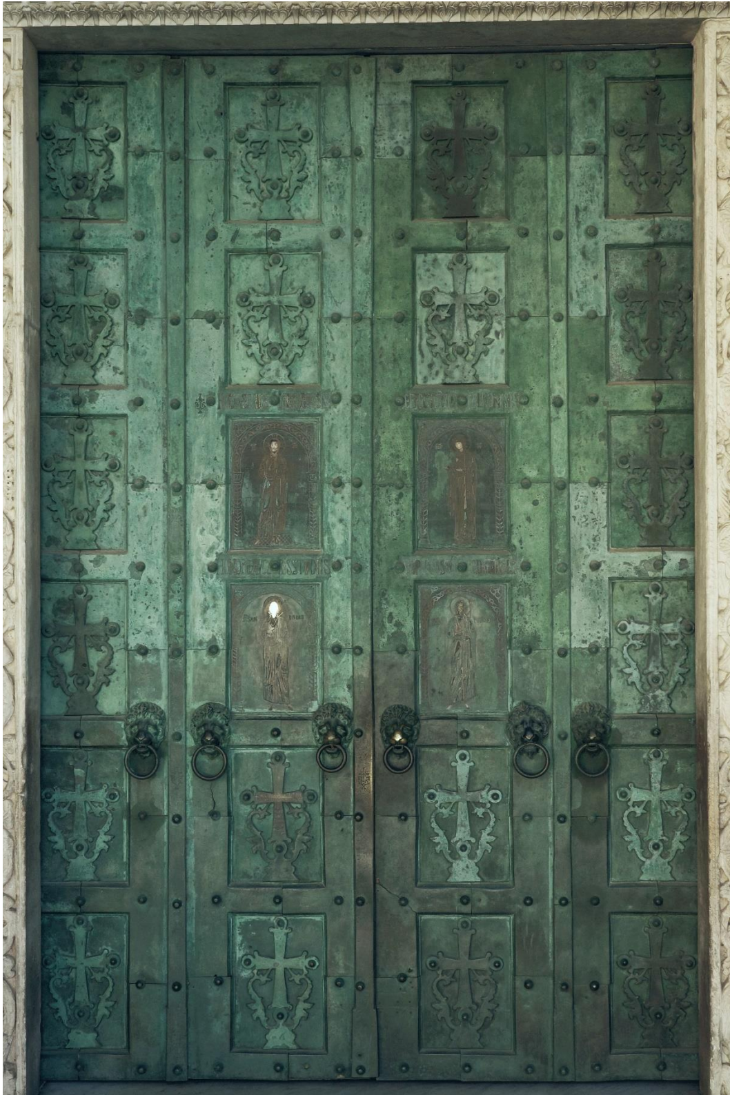
Figure 6: The doors from Amalfi, Italy.