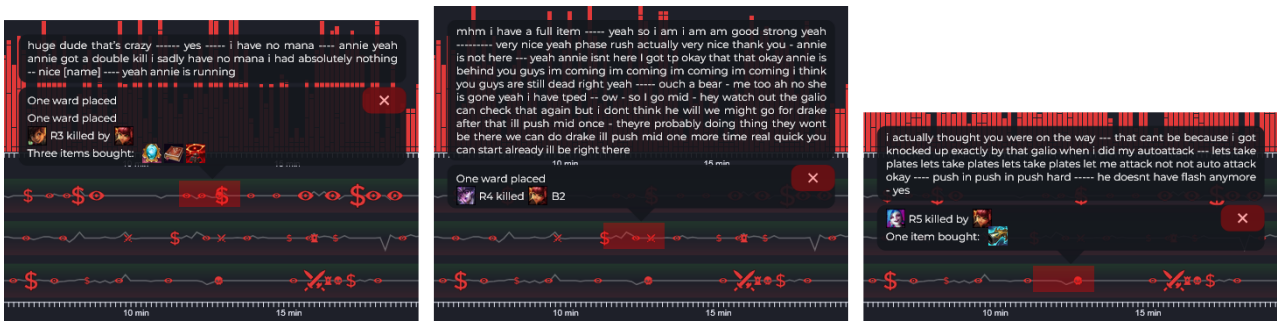
Figure 3: Excerpts of the timeline showing the communication and events related to R3 (left), R4 (middle), and R5 (right) during a fight.

the visualizations could be extended or complemented to display aggregated data from multiple matches, providing a more comprehensive understanding of team dynamics.