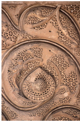
Fig. 2: Example of Ilkhanid stucco revetment from the Pir-i Bakran mausoleum in Linjan, South of Isfahan.