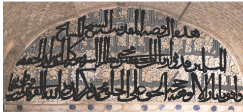
Fig. 7: Historic inscription at the Pir-i Bakran mausoleum and its digital copy.