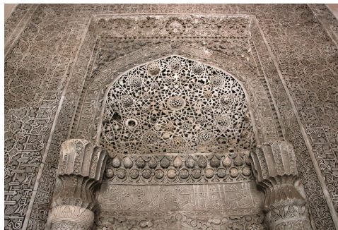
Fig. 1: Orumiyyeh Friday mosque in North-Western Iran (Seljuk mosque and Ilkhanid stucco revetment). Detail of whitewashed stucco mihrab.