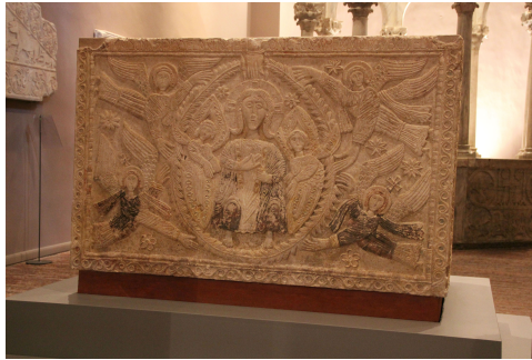
Fig. 5: Ratchis altar with remaining polychromy traces, stored in the Cividale archaeological museum.