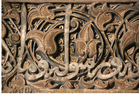
Fig. 4: Detail of the Oljeitu mihrab (1310) at the Friday mosque of Isfahan. The digital photo shows the amount of remaining stucco polychromy on the mihrab.