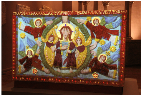
Fig. 6: Projection of hypothetical original polychromy reconstruction on the Ratchis altar for didactic purposes. The projection is animated and based on archaeometric research of the altar.