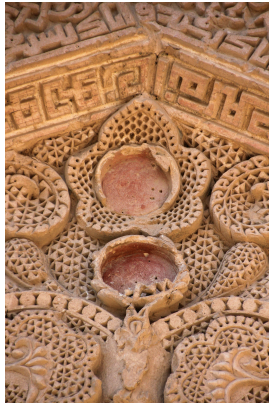
Fig. 3: Example of Ilkhanid stucco mihrab (with polychromy traces) of the Seljuk period Friday mosque of Haftshuyeh near Isfahan. (Grbanovic 2014)