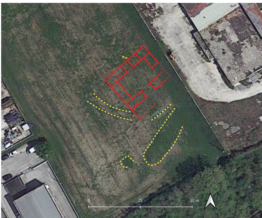
Figure 8 - Interpretation of the crop marks in Figure 7.