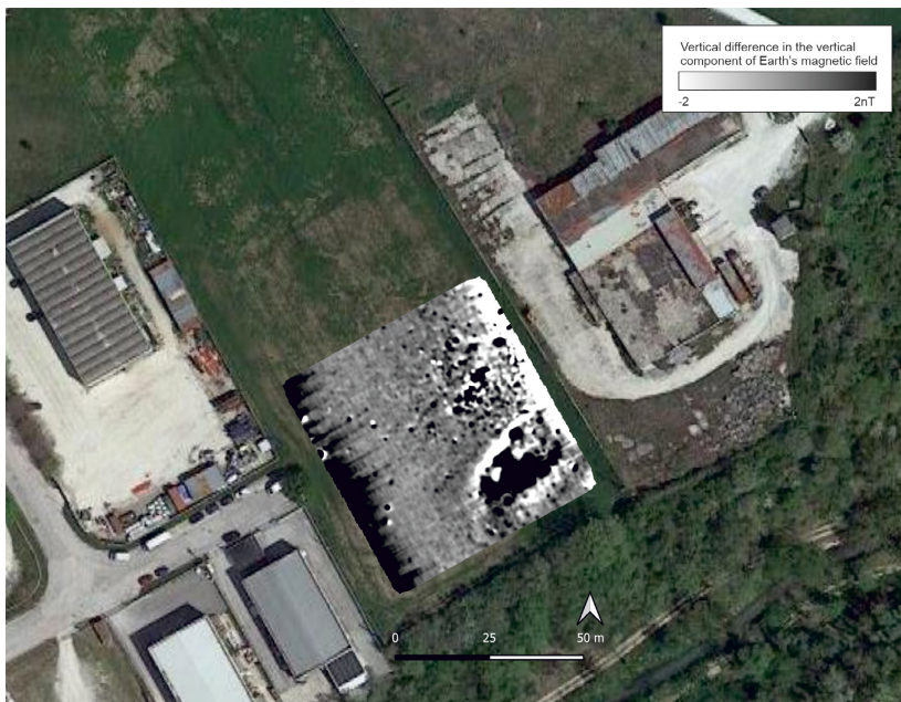
Figure 9 - Image from the magnetometry at Castelraimondo, positioned on the satellite view of the site.