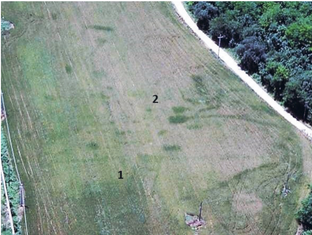
Figure 2 - Crop marks of site PVS 100, probably a Roman farm or small villa, photographed during prospection flights over Camerino in 2002. The presence of a rectangular building (circa 20x10m), divided in several spaces (nr. 1) and other architectural structures with underground rooms, cellars or cisterns nearby (nr. 2) can be well distinguished.

Such traces indicating architectural and other relevant anomalies in the soil were for instance observed on site PVS 100, probably a large Roman farm or simple villa, located in the territory of ancient Camerinum (Fig. 2). The rural site, with a well-chosen location on a natural gravel terrace at a few meters south of the river Potenza, reveals the presence of a rectangular building (circa 20x10m), divided in several spaces, and close to other architectural structures with probably underground rooms, cellars or cisterns. Close examination in the field on two occasions (in 2003 and 2015) showed the presence in the area of the observed crop marks of dense concentrations of Roman pottery fragments (e.g., table ware, dolia, amphorae,...) and building material (bricks, floor slabs, lumps of concrete,...) in a total area of circa 0.8