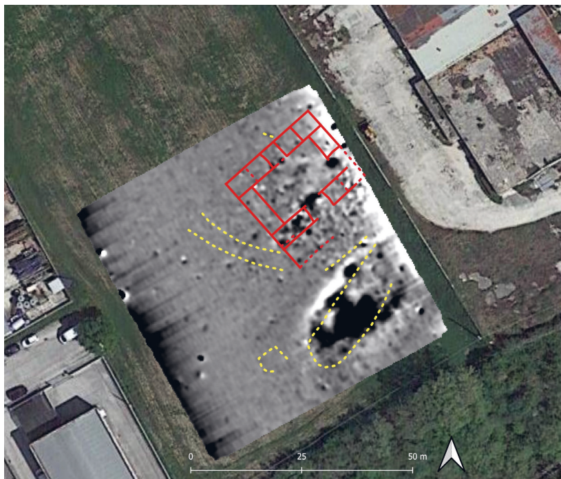
Figure 10 - Superposition of the interpretation of the crop marks on the magnetometry data in Figure 9.