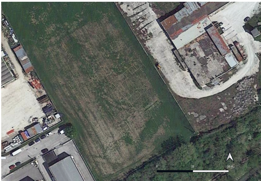
Figure 7 - Satellite image from April 2022 on Google Earth showing the full plan of the small villa at Castelraimondo.