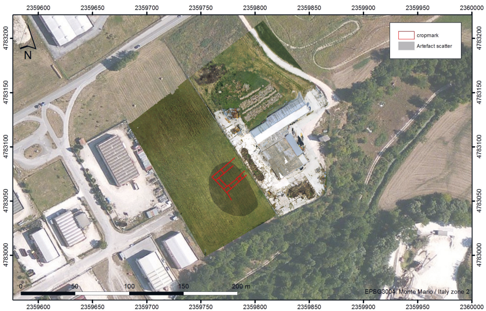
Figure 6 - Location of the artefact scatter and first interpretation of the crop marks shown in Figure 5 on a vertical image of the site.