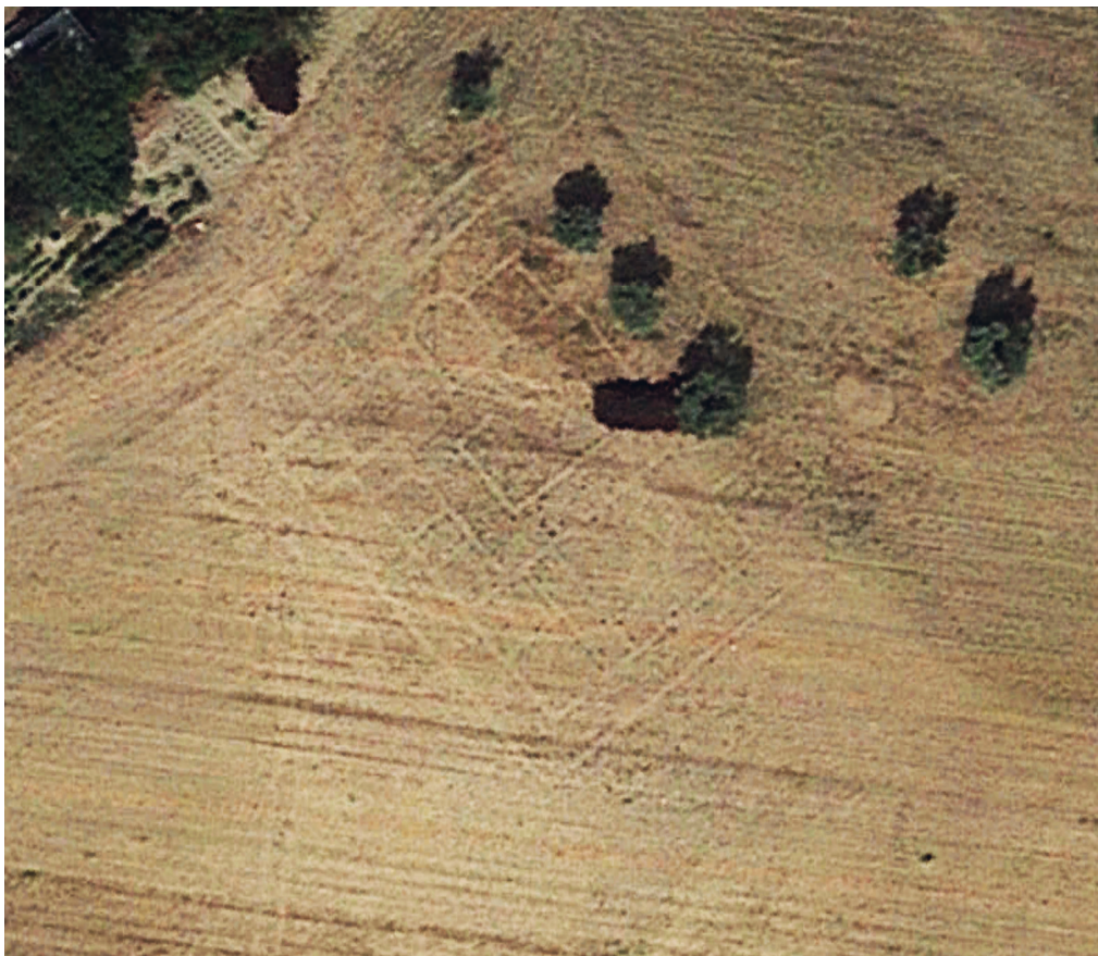
Figure 4 - Satellite image from 31.8.2017 on Google Earth showing the full plan of the pars urbana of a villa in San Severino Marche (fraz. Rocchetta; site M15), situated four km NE from the Roman town of Septempeda.

Our aerial photography monitoring of all known sites in this upper part of the Potenza valley revealed in 2003 distinct linear crop marks of a rectangular building of circa 25x20m at exactly the same spot where the artefact concentration had indicated the presence of the Roman rural settlement (Fig. 5 and 6). It showed a rectangular building with NE/SW orientation, more or less parallel with the river Potenza, containing a central courtyard surrounded by regularly spaced rooms. The crop marks were less clear towards the east and south and, therefore, a full plan of the building could not be proposed yet.