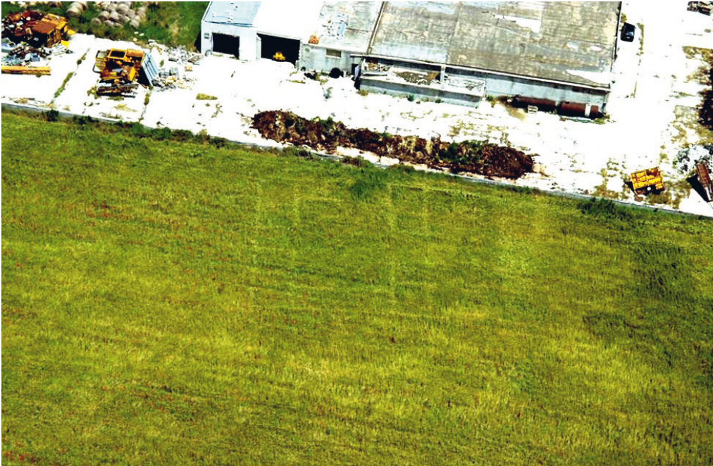
Figure 5 - Crop marks of site PVS 41 photographed during prospection flights over Castelraimondo in 2003.