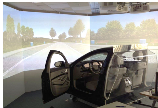
Figure 1: The setup of the driving simulator.

To automatically assign emotions to textual units, the application of dictionaries has been a popular approach and still is, particularly in domains without annotated corpora. Another approach to overcome the lack of huge amounts of annotated training data in a particular domain or for a specific topic is to exploit distant supervision: use the signal of occurrences of emoticons or specific hashtags or words to automatically label the data. This is sometimes referred to as self-labeling (Klinger et al., 2018; Pool and Nissim, 2016; Felbo et al., 2017; Wang et al., 2012).