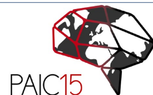
FIGURE 3 The PAIC15 scale