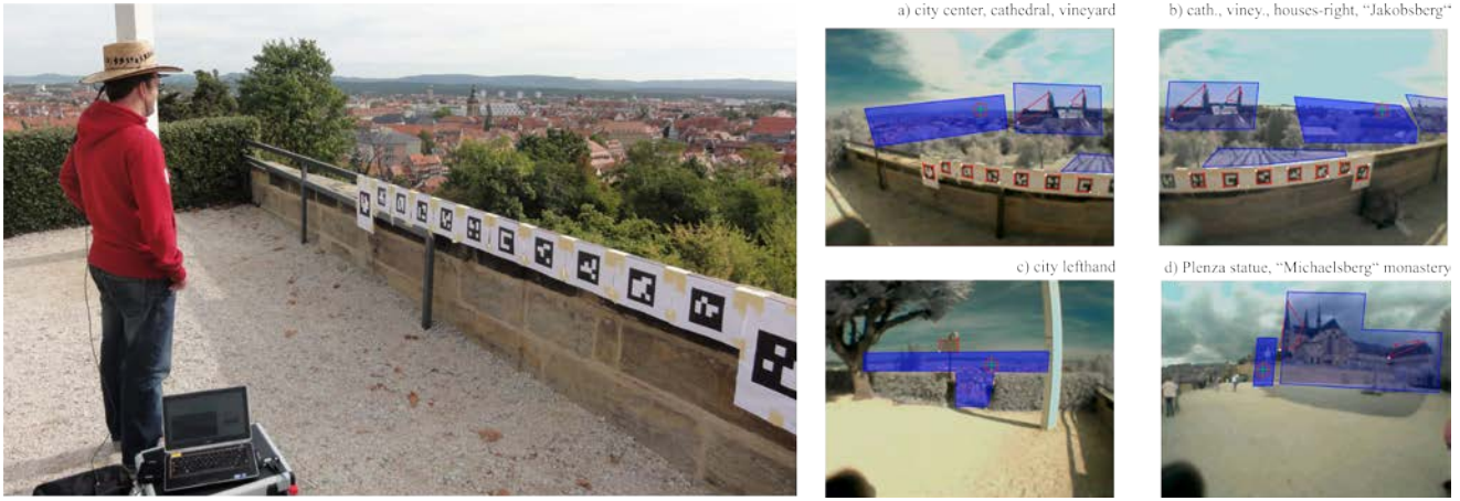
Figure 1 Study set-up (left). Panorama, as seen through the scene camera (right), overlaid with markers (red) and AOIs (blue).

paper, we pose a novel question: can we predict when the participant will stop looking at the stimulus? Prediction models exploit spatio-temporal regularities in gaze data. Machine learning offers an automated and objective way of finding these regularities [Bednarik et al. 2012]. Here, we learn a very simple prediction model: a linear regression.