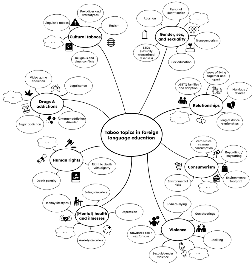
Figure 1.2 Contemporary Taboos and Controversial Topics.