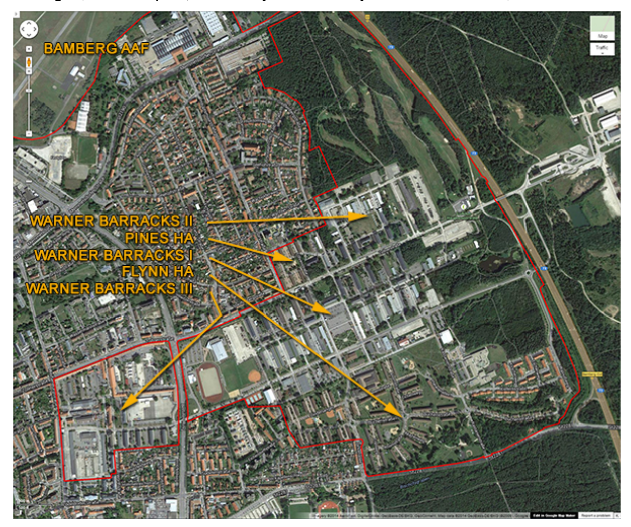
Fig. 1: The three different sites of Warner Barracks and American housing areas in Bamberg. Part I and II (including pines area) is occupied today by the federal Police's training facilities, Flynn housing area is a refugee camp and in part III the new "Lagarde-Campus" is considered for urban development. (Source:

depot ("Muna") and a small airfield. The Warner Barracks themselves can be partitioned, once again, into three parts, renamed by the U.S. Army in Warner Barracks I, II and III.