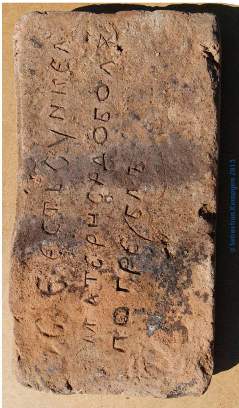
Fig. 1: The Synkel slab