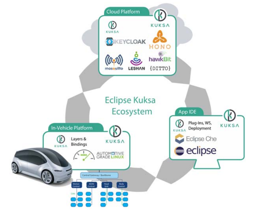
Figure 1: Overview of the Eclipse Kuksa Platforms

With Eclipse Kuksa, initial implementations for an open source ecosystem amongst the connected vehicle domain are given in order to tackle a breakthrough from closed source proprietary development activities towards an open and standardized environment. Such an environment opens the automotive market and lets OEMs, tool vendors, and various tier suppliers cooperate and focus on unique selling points of more advanced applications and infrastructures. Therefore, three major platforms are required to support (a) the vehicle, (b) the cloud, and (c) the IDE as seen in Figure 1: Overview of the Eclipse Kuksa Platforms.