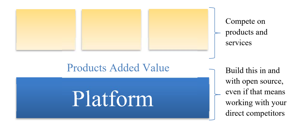
Figure 2: A business friendly ecosystem with a common platform and advanced products

Governance, IP management, collaborative infrastructure, and recommended development processes are just some of the benefits developers can make use of when conducting a project under the Eclipse Foundation umbrella. With the latest GitHub report<sup>4</sup>, over 31 million users share experience and knowhow in order to learn, share, and work together to build software across more than 100 million repositories as of November 2018. Consequently, having open source code on GitHub has proven to help in reaching project goals, get consumer attention, and build a community to further enhance, sustain, and maintain the code (for free!).