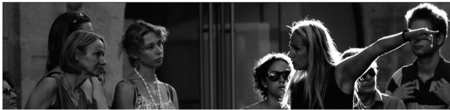
Figure 1. “Weg.weisend”; photograph by Claudia Otto. Note that due to legal issues we cannot show the original stimulus material here but see http://www.fotocommunity.de/user_photos/907351?page=3&folder_id=291324 .

(see Figure 1). The construct of Semantic Instability ( SeIns , Muth & Carbon, 2016) refers to different phenomena in art that similarly hinder easy perception of determinacy (like multistability, dichotomy, experience of hidden images or visual indeterminacy). Besides other interesting aspects of the aforementioned photographs, we can focus on their multistability: they allow for several quite clear but mutually exclusive interpretations of the scene (e.g., a man greets someone or bids farewell, respectively). As this multistability specifically refers to an oscillation between valences, e.g. being sometimes positive and sometimes negative, we can refine the concept towards the construct of ambivalence.