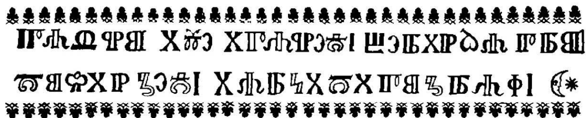
Fig. 1: Pamvo Berynda's Glagolitic ornament (1631)

He reproduces the full text of the Prologue to the Triodion written by the corrector Tarasij Zemka, and then the full Epilogue by the same author which makes up the last two pages of the 1631 edition. The Epilogue ends with a sample of the alphabet used for printing the Triodion and then features a Glagolitic ornament, before ending with four more lines of text and the obligatory "Amen". See Addendum I (below) for a picture of the full page.