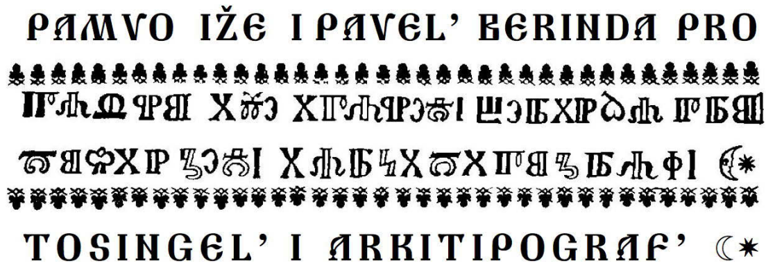
Fig. 2: Glagolitic ornament with transliteration

So, first, we would like to transliterate the Glagolitic text using Latin letters – see the following figure.