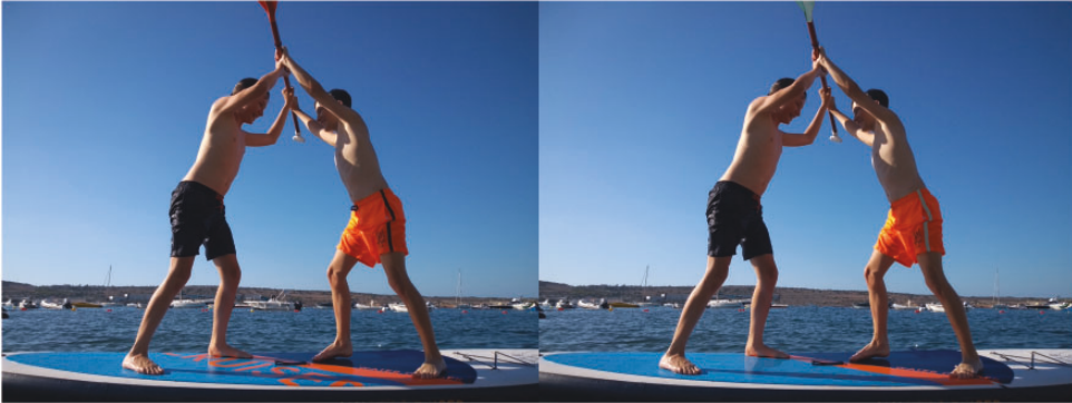
Figure 1. Spot five differences between two pictures.

differences (Grimes, 1996). A better known and far more widely used approach is a flicker paradigm when two photographs are presented intermittently with a brief blank screen in-between (Rensink et al., 1997). What makes this phenomenon so counterintuitive is the sheer salience of the difference once it has been spotted. The discovered change is so obvious that it is hard to understand, why it was so difficult to find it just seconds ago. More importantly, it reflects the limitation of our perceptual and cognitive system rather than the artificial nature of the flicker task (Carbon, 2014). The same blindness to large changes in the environment occurs in naturalistic settings, for example, while talking to a stranger (Simons & Levin, 1998), inspecting the stranger's face (Utz & Carbon, 2020), or even making tea (Tatler, 2001). This implies that we experience change blindness daily (and, most probably, many times a day) but fail to notice it, as there is no experimenter to inform us about it and no solution is provided on the back pages.